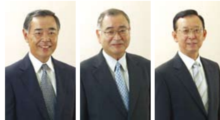
Senior Executive Officer