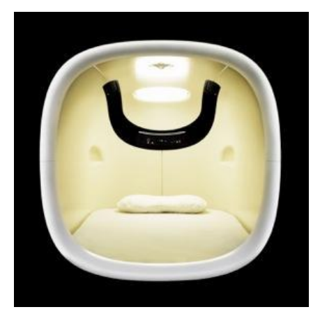
Sleeping pod (front)

[About "nine hours"] Around half of the guests using "nine hours" Kyoto, which opened in 2009 as a functional accommodation facility catering to individual traveling styles, are from overseas. This is a capsule hotel with a difference that offers cleanliness, comfort, quality bedding and amenities for all customers including women as well as overseas visitors.