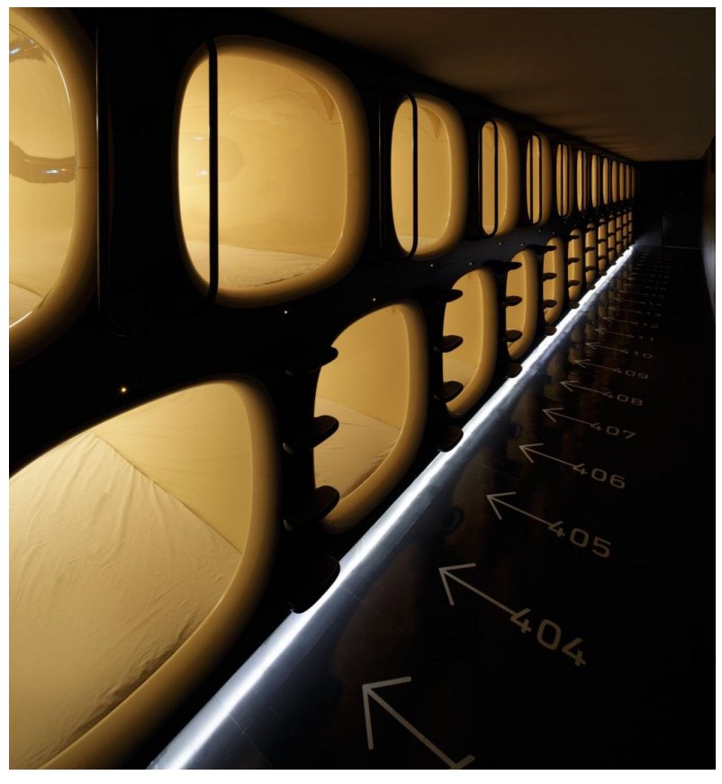
Capsule unit area

The softly lit capsule units offer a relaxing environment even for short rest periods.