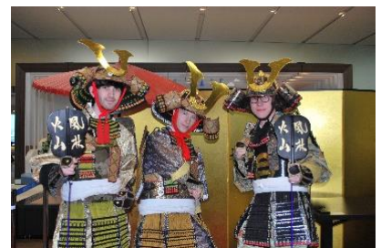
Samurai armor dress-up

April will feature opportunities to try on a samurai armor, the very popular hands-on Ukiyo-e printing to take home as a souvenir, kimono dress-up, as well as calligraphy, Japanese paper dolls and kite making. Events are held every day in the departure area after the security check and passport control.