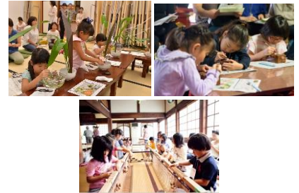
Japanese craftpersons workshops

This is a program planned and held in collaboration with "Yume Rakuza Project" offering customers a chance to choose and try their hands at a variety of craftpersons related to traditional Japanese crafts, culture and performing arts, according to their own interests and preferences. These will be genuine practical courses led by experts who actually work in the profession. Please refer to the attachment for details of the program.