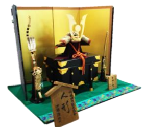
Boys' Festival doll display

Boys' Festival dolls will be put on display to celebrate the festival on May 5. The dolls are displayed during the festival to celebrate the birth of boys and pray for their healthy growth. The armor and helmet symbolize the hope that boys will be protected from harm.