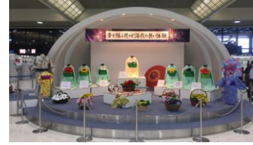
&lt; Preview &gt;

We also present a rare opportunity to wear the formal furisode long-sleeve kimono and the hakama pleated trousers, and have a souvenir photo taken.