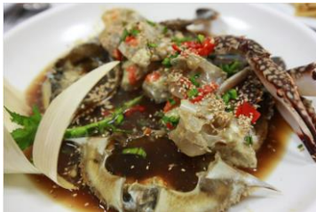
< Ganjang-gejang >

Narita Airport has an ongoing commitment to expanding and improving its destination network for the benefit of our valued customers. Take advantage of Narita Airport's extensive network, now made even better with the JEJU air' Muan service.