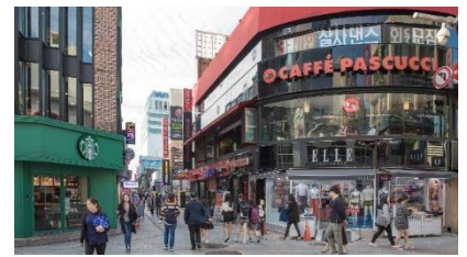
< Chungjang-ro Street >