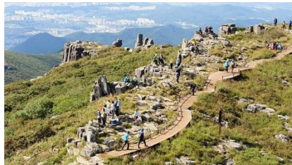
< Mudeungsan National Park >