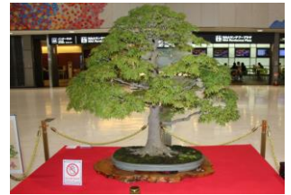
&lt;The previous exhibition&gt;

These exhibitions will come to life on May 13th and 20th when visitors to the airport can watch the careful art of bonsai.