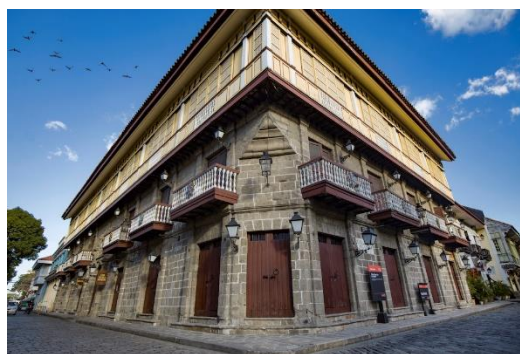
Casa Manila Museum