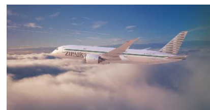
ZIPAIR Boeing 787