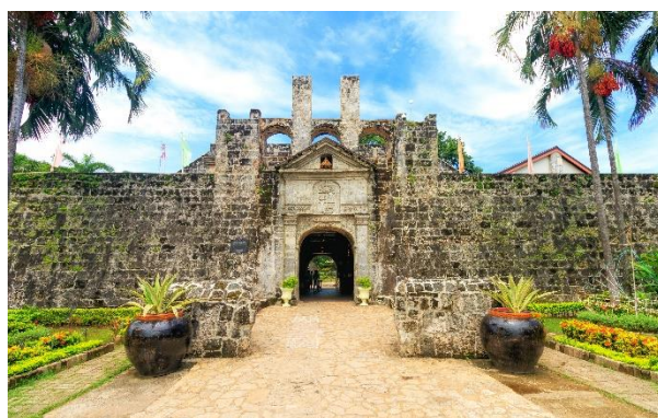
&lt;Fort San Pedro&gt;