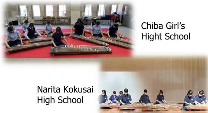
Chiba Girl's Hight School