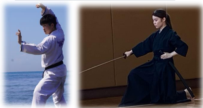
Chiba University (Karate)