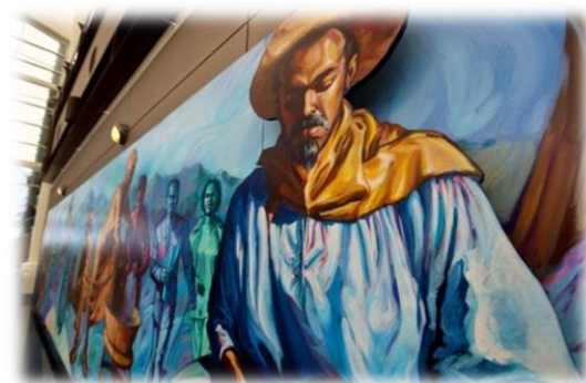
▲ Photographs on Display