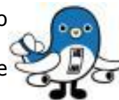
Narita's mascot "Unarikun" will be there!