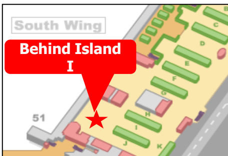
Terminal 1, Landside 4F, South Wing, behind Island I