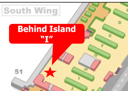
Terminal 1, Landside 4F, South Wing, behind Island I