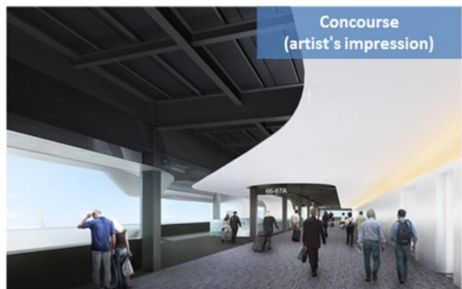
Concourse (artist's impression)

This addition will bring the total number of fixed gates at Terminal 2 from 28 to 32. The new gates will function as swing gates so that they can be used for both international and domestic services by opening and closing the doors inside the fixed loading bridge.