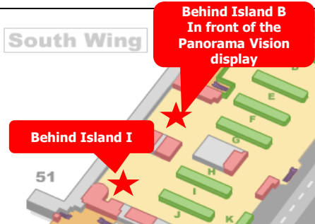
Terminal 1, Landside 4F, South Wing, In front of the Panorama Vision display behind Island G Behind Island I