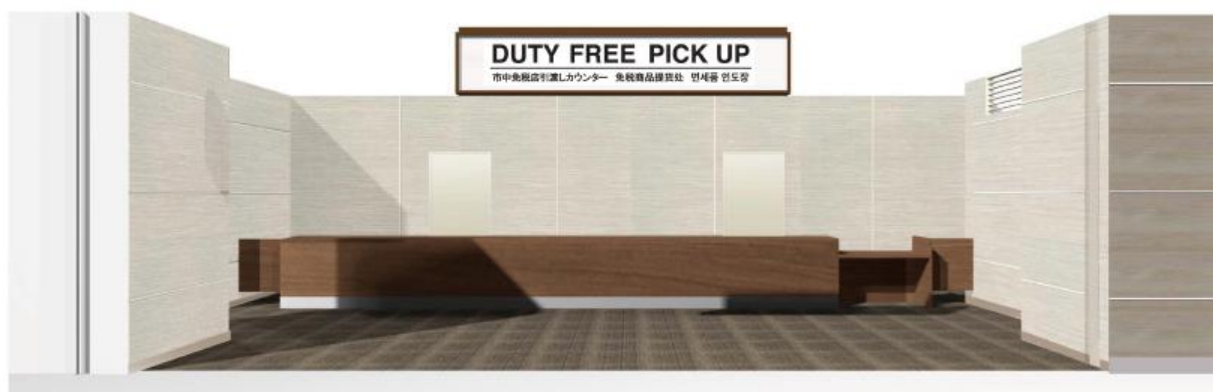
(Illustration (Terminal 1))

This new service will enable all people both foreigners visiting Japan and resident in Japan (Japanese and foreign) to enjoy unhurried duty-free shopping prior to their departure from Japan. People can enjoy a completely new style of duty-free shopping!