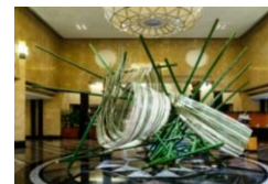
Exhibit from a previous display

The traditional art of Ikebana will also be on display in the terminals, courtesy of the Sogetsu school of flower arrangement. Experience the dynamic yet delicate art of Japan with green bamboo towering more than 4 meters into the air surrounded by the vivid color of flowers.