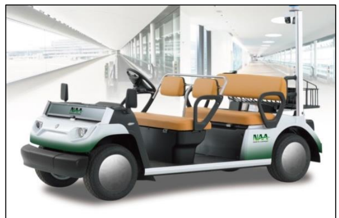
Illustration of passenger cart

Narita Airport is continuing in its efforts to offer greater customer convenience so that it is easier to use for all customers.