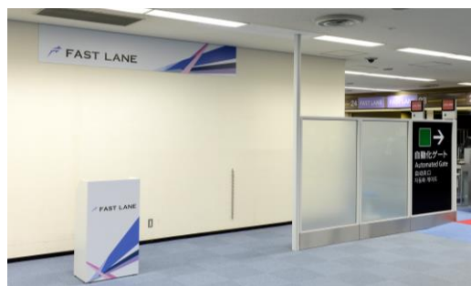
【Terminal 2 Fast Lane】