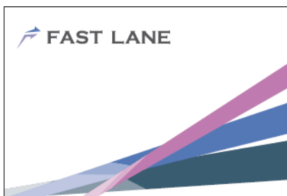
[Fast Lane Coupon (Face)]