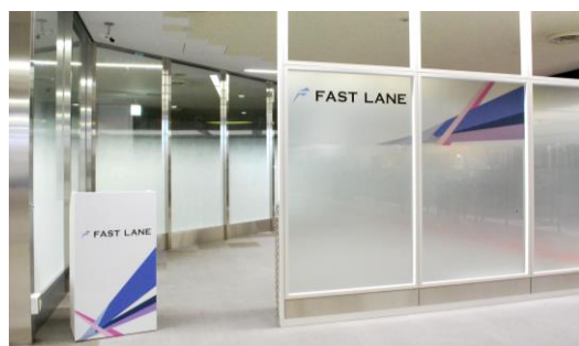
【Terminal 1 Fast Lane】

As the number of foreign visitors to Japan grows rapidly towards 2020, Narita Airport will make arrival procedures as rapid and stress-free as possible, in order to continue serving as one of the most comfortable airports in the world.