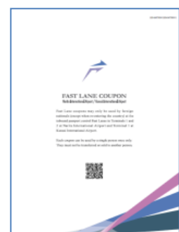
[Fast Lane Coupon for Conference Attendee]

* Fast Lane use is a service provided under a user agreement between NAA, airlines and professional congress organizers (PCO).