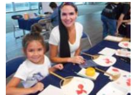
Making Chigiri-e collages

In June, customers are invited to experience printing an Ukiyo-e, which is very popular as a souvenir, make Chigiri-e (torn paper collages) and try on a kimono or samurai armor.