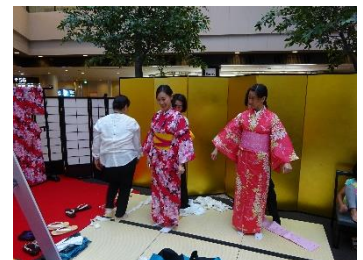
Trying on a yukata

Different event is held every day in the area after the departure immigration.