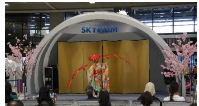
Dance performance staged last time

Venue: Terminal 2, Before the departure security-check area, 3rd floor, south end waiting area, Narita Airport Stage, SKYRIUM