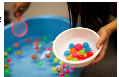
Scooping up bouncy balls

Venue: Terminal 2, Before the departure security-check area, 3rd floor, south end waiting area, Narita Airport Stage, SKYRIUM