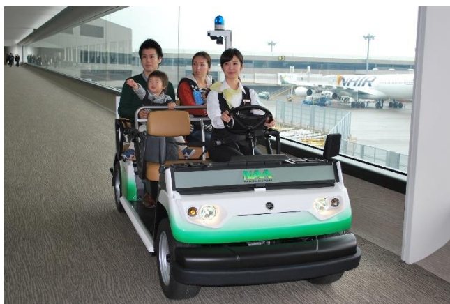
Passenger cart carrying customers

Narita Airport is the main gateway to Japan and the international hub airport for Greater Tokyo area. We will serve travelers with the at most hospitality and in its efforts to offer greater passenger experience.