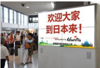
[4-screen display in Terminal 1 arrival lobby]