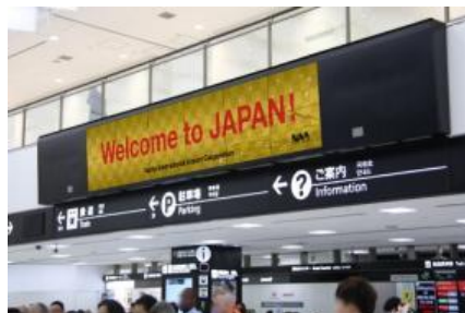
[12-screen display in Terminal 2 arrival lobby]