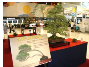
The previous exhibition

Where: Central area on the 3rd floor in the public area before the departure security check at Terminal 2