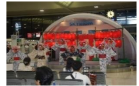
The previous performance

Our autumn program will showcase dance performances and various other events that will really give visitors a sense of the Japanese seasons.