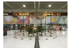
The previous exhibition

Dynamic works reaching as high as 5 meters will be exhibited at 3 locations in the terminal, for customers to enjoy these traditional works of art.