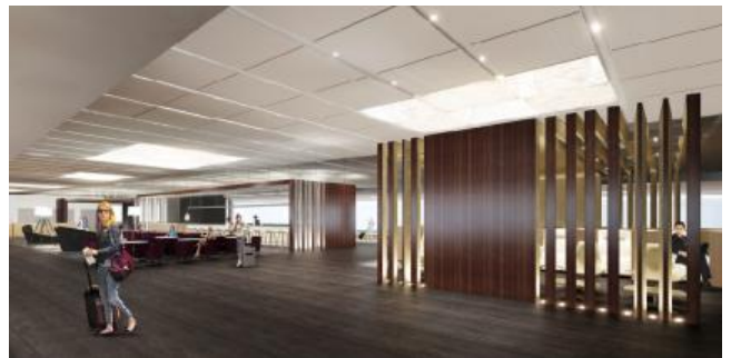
Terminal 2 connecting corridor (illustration)